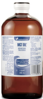
Infant, Child & Woman