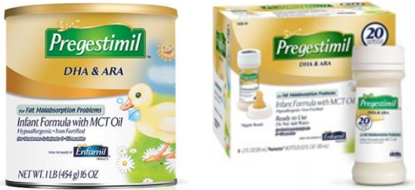
Infant & Child

Pregestimil 16 oz powder & 6 pack (2 oz) ready-to-use