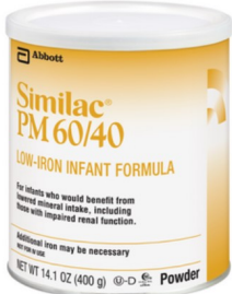
Infant & Child

Pregestimil 16 oz powder & 6 pack (2 oz) ready-to-use