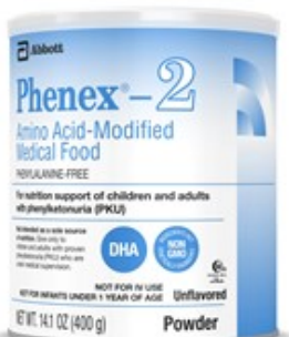
Infant & Child