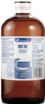
Infant, Child & Woman