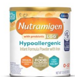
Infant & Child