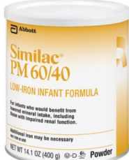
Infant & Child