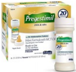
Infant & Child