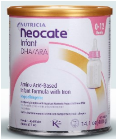
Infant & Child