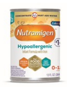
Infant & Child