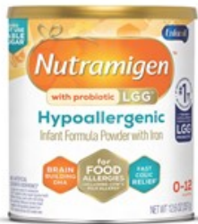
Infant & Child