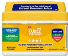
1.5 small cans