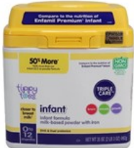
2 small cans