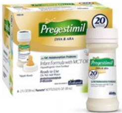
Infant & Child