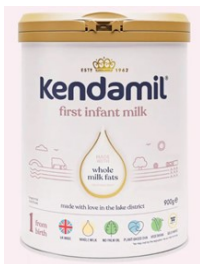
2 small cans