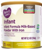
1 small can

12.5 oz powder, 22.2 oz powder, 36 oz powder