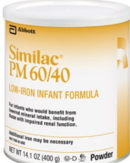
Infant & Child