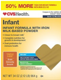
2 small cans