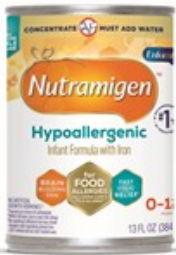
Infant & Child