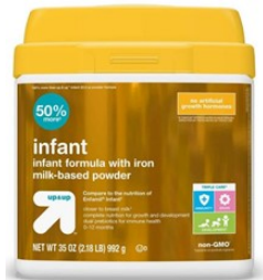
2 small cans