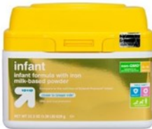
1.5 small cans