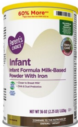
2 small cans