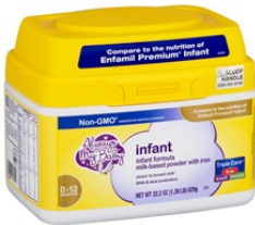
1.5 small cans