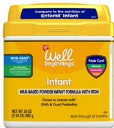
2 small cans