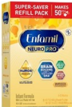
2.5 small cans

12.5 oz powder, 22.2 oz powder, 36 oz powder