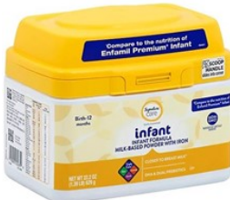
1.5 small cans