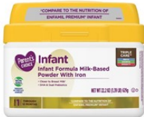
1.5 small cans