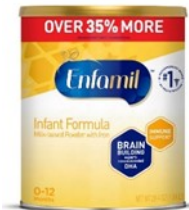
2 small cans

20.7 oz powder, 28.3 oz powder, 31.4 oz powder, 36.4 oz powder