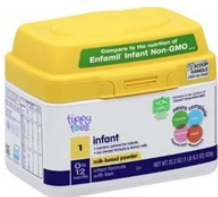
1.5 small cans