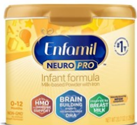
1.5 small cans

20.7 oz powder, 28.3 oz powder, 31.4 oz powder, 36.4 oz powder