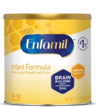
1.5 small cans