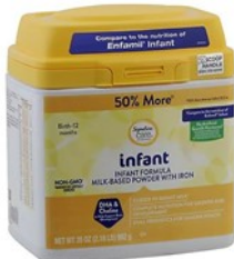
2 small cans