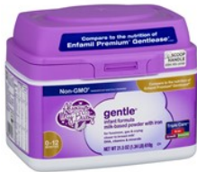
1.5 small cans