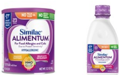
Infant & Child