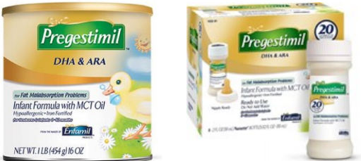
Infant & Child

16 oz powder & 6 pack (2 oz) ready-to-use