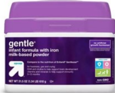
1.5 small cans