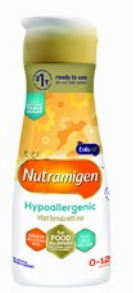
Infant & Child