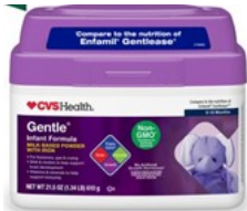
1.5 small cans