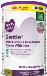
2 small cans