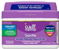
1.5 small cans