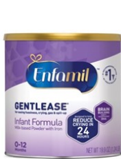
1.5 small cans