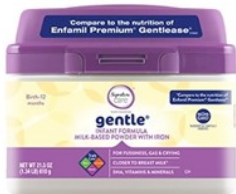
1.5 small cans