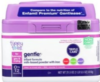
1.5 small cans