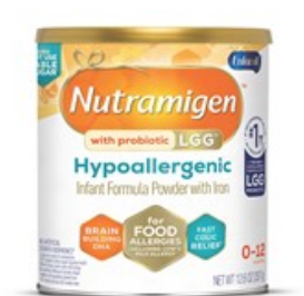
Infant & Child