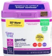
2 small cans