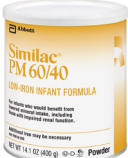
Infant & Child