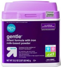
2 small cans