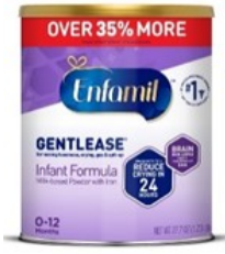
2 small cans

19.5 oz powder, 27.4 oz powder, 30.4 oz powder