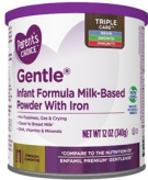
1 small can

12 oz powder, 21.5 oz powder, 34 oz powder