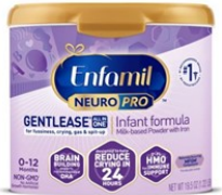
1.5 small cans

19.5 oz powder, 27.4 oz powder, 30.4 oz powder