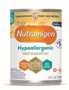
Infant & Child