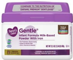
1.5 small cans