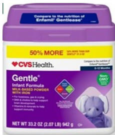
2 small cans