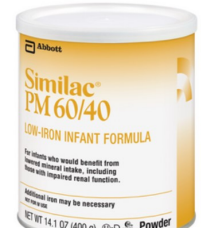
Infant & Child