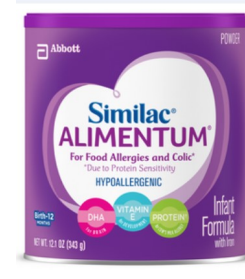
Infant & Child